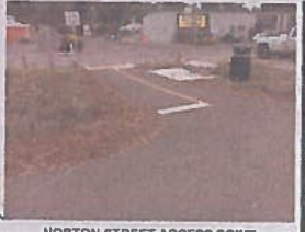
NORTON STREET ACCESS POINT (VIEW WEST)