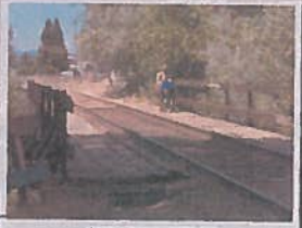
ORR CREEK BRIDGE (VIEW NORTH)