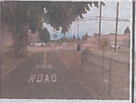
PERKINS ST. (VIEW NORTH)