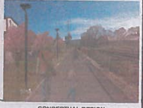
CONCEPTUAL DESIGN (VIEW SOUTH)