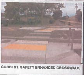
GOBBI ST. SAFETY ENHANCED CROSSWALK