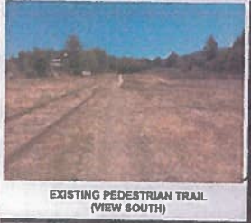
EXISTING PEDESTRIAN TRAIL (VIEW SOUTH)