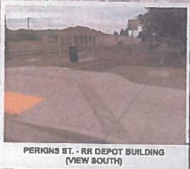
PERKINS ST. - RR DEPOT BUILDING (VIEW SOUTH)