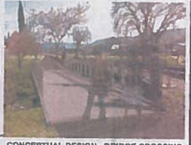
CONCEPTUAL DESIGN - BRIDGE CROSSING (VIEW SOUTH)