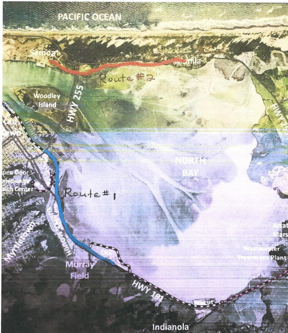
Proposed routes Route #1 (blue): Halvorsen Park north Route #2 (red): Samoa to Manila mini golf