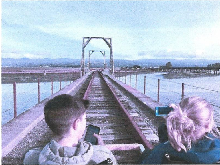
The view over Eureka Slough