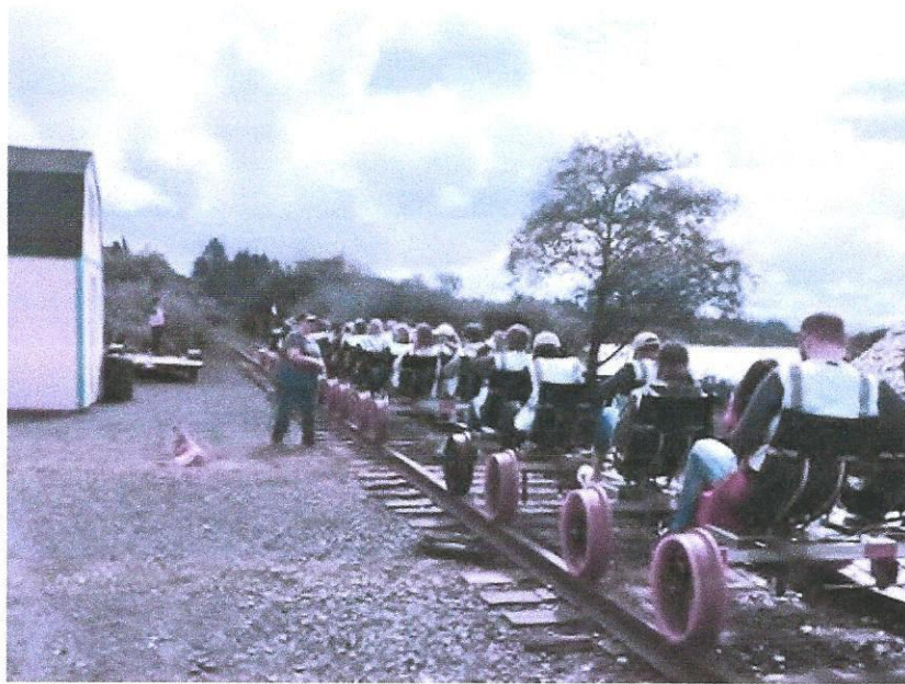
Oregon Coast Rail Rider staging in Tillamook Oregon